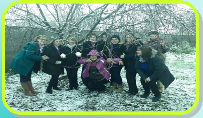
Enjoying the snow before starting the session