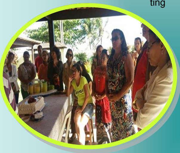
Seventh Region in plenary meeting