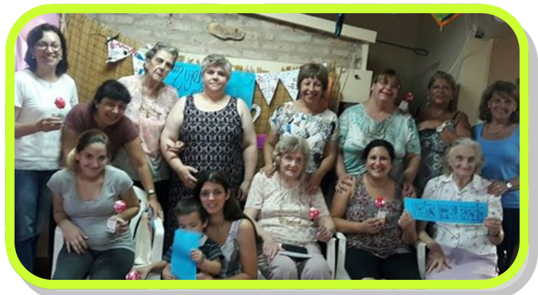
Encounter of women FeMMA Pastoral.Colón, Entre Ríos