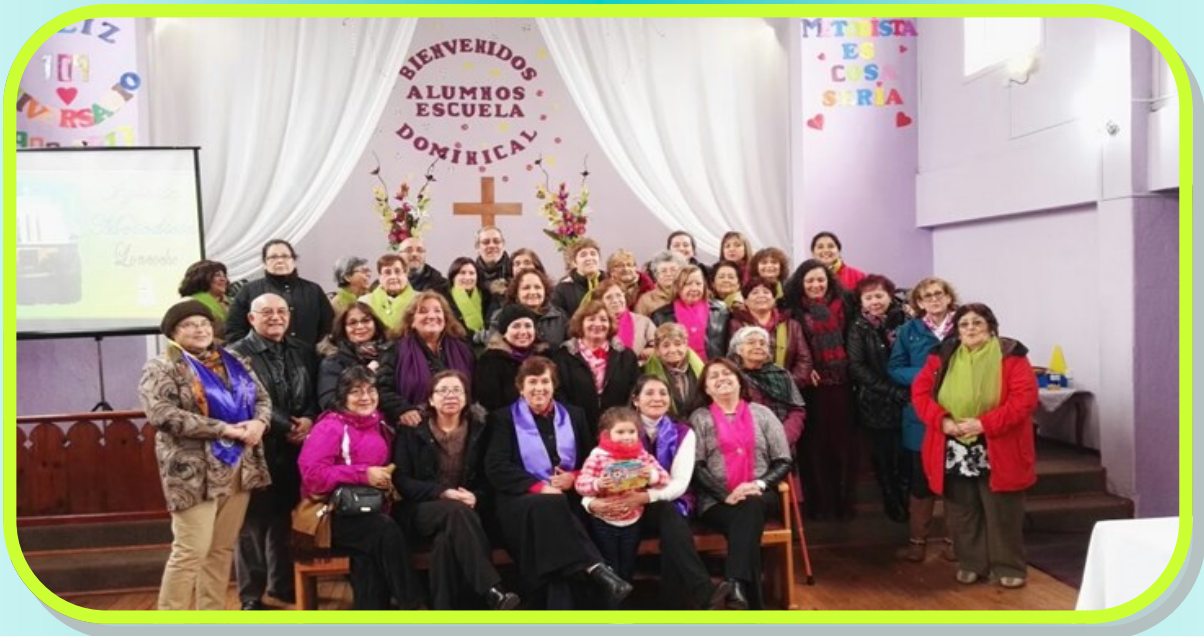
Sisters of South District