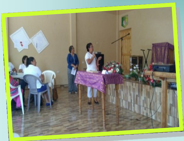
Presentation of the works of each female society