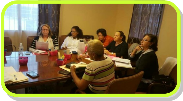
First Meeting of the National Board and Workshop with Topic: Principles of Leadership in our Ministries